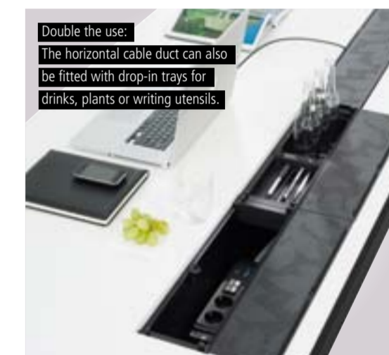
Double the use: The horizontal cable duct can also be fitted with drop-in trays for drinks, plants or writing utensils.