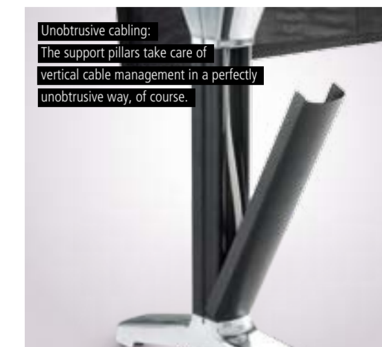
Unobtrusive cabling: The support pillars take care of vertical cable management in a perfectly unobtrusive way, of course.