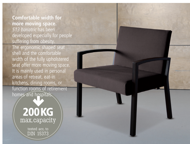
Comfortable width for more moving space. S13 bariatric has been developed especially for people suffering from obesity. The ergonomic shaped seat shell and the comfortable width of the fully upholstered seat offer more moving space. It is mainly used in personal areas of retreat, eat-in kitchens, dining rooms, or function rooms of retirement homes and hospitals.

200 KG max. capacity tested acc. to DIN 15373