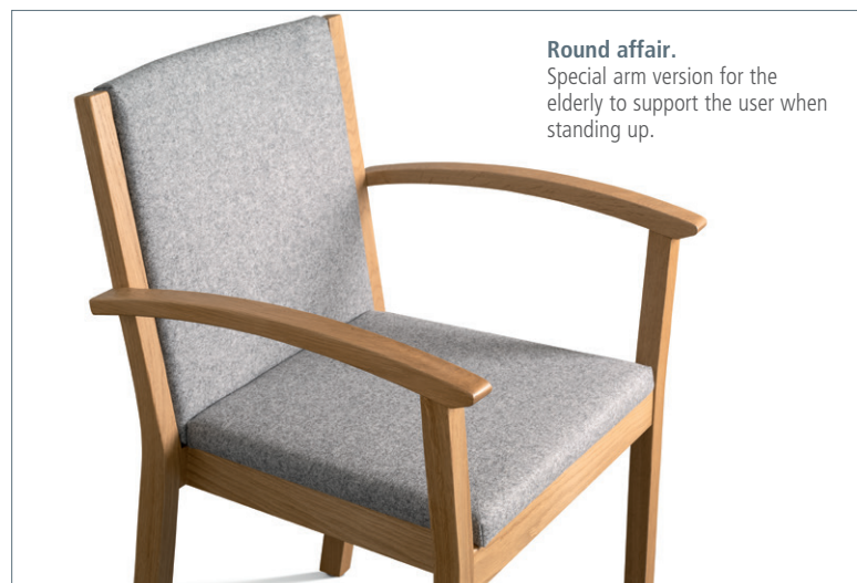
Round affair. Special arm version for the elderly to support the user when standing up.