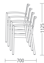
stackability models 6710 and 6711

Stacking: Stacking models 6710 and 6711: max. 4 chairs on the ground. Chairs with ergonomically shaped armrest for elderly people: max. 3 chairs on the ground. Stacking trolley: model 6491-000.