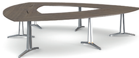
skill system table