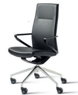
6204 Conference chair with arms Seat and back upholstered H 1050 / SH 435 / W 745 / D 745