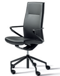
5440 Swivel chair with arms Seat and back upholstered H 1055-1170 / SH 415-530 / W 745 / D 745

Twist-balance mechanism. Balanced dynamic sitting and mobility of the seat and back promote the micro-movements of the spinal column. The supply of nutrients to the intervertebral discs is stimulated and thus the ergonomic effectiveness is increased.