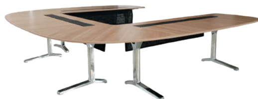
pulse conference table

A-4950 Altheim Linzer Strasse 22 T +43 (7723) 460-0 altheim@wiesner-hager.com