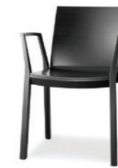
6890-200 Stacking chair

Beech Seat shell plywood W 520 / D 550 / SH 450 / H 800