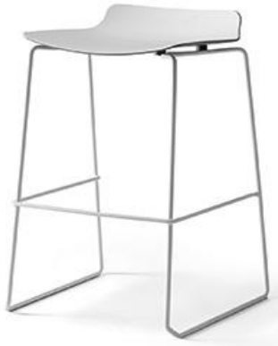
Design: neunzig° design